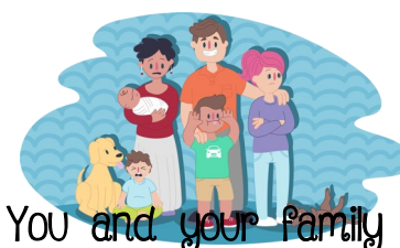
You and your family