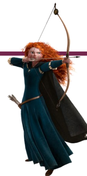
Your favourite movie