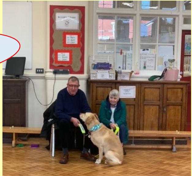
Friends from the Guide Dog Association