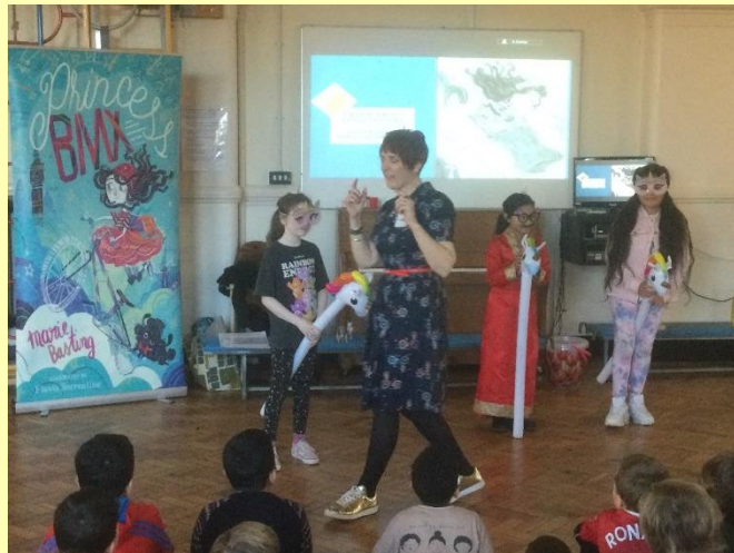
Bollywood Dance from Aimz Dance School