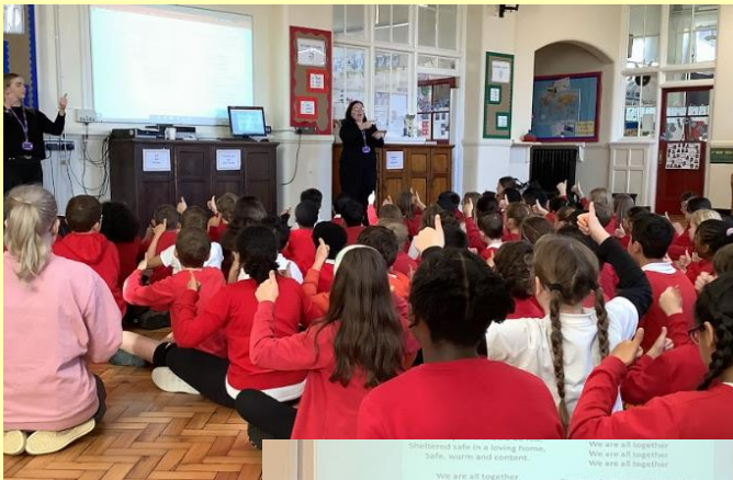
Manchester Deaf Centre and their sing & sign session